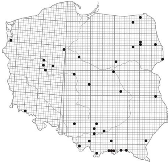
Fig. 1. Locations of Leiopus nebulosus (L.) in Poland (UTM grid map).

Voucher specimens are present in authors' collections, all other cases were listed in the text.